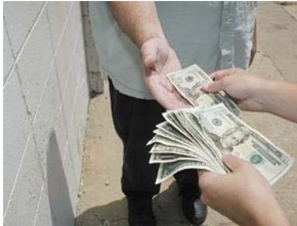
The Searcy Fast Cash store on Race Avenue was one of 14 Fast Cash locations fined 1.3 million for operating illegally in Arkansas.