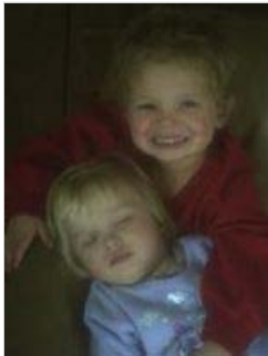
Scrapbook (44 photos)